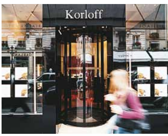
Circular sliding door - Jeweller, France