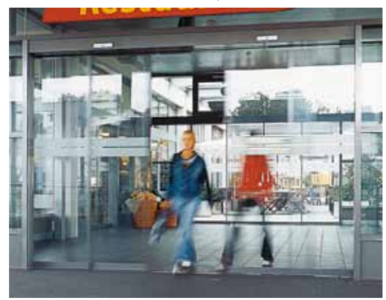
Sliding telescopic door - Restaurant, Switzerland