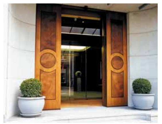
Burglar-resistant door - Bank, Suisse