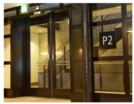
Automatic fire-protection door, multi-storey car park, Switzerland

record FlipFlow is an automatic entrance system for one-way access control. It consists of a two-leaf swivelling door and two automatic barriers. If any attempt is made to turn back, the barriers automatically block the path. The swivelling door leaf immediately closes and locks, and the event is reported to the building control system. Easily integrated into existing security systems, the FlipFlow has been installed at many public places in Europe where security is a requirement. It is ideally suited as a second entrance in supermarkets, shopping centres and retailers at railway stations.