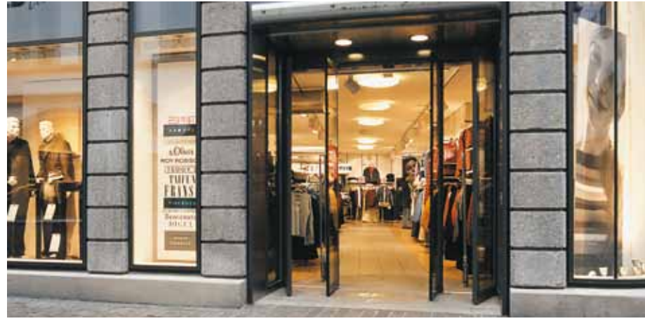
Sliding doors with total opening system – Fashion boutique, Switzerland