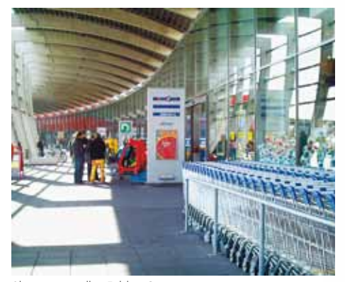
Shopping mall - Fulda, Germany

Today, record produces and installs a vast range of automatic doors and peripherals covering every conceivable application and need.