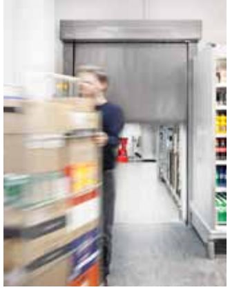
Crash proof rapid shutter door record SPEEDCORD – Warehouse, Switzerland